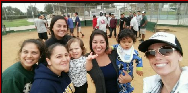
Some of the fans present to cheer at the Alumni Games